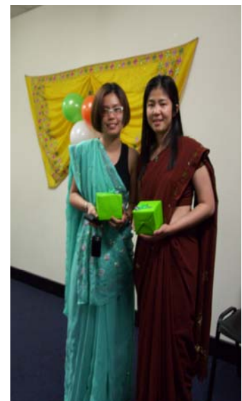
Our Prizes winners, looking beautiful in their Saris.

puffs) baked especially for friendship day.